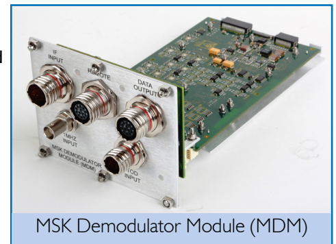
MSK Demodulator Module (MDM)