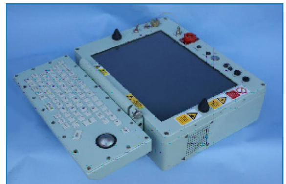
Drumgrange's HVME (TR) provides a comprehensive vibration investigation and monitoring capability