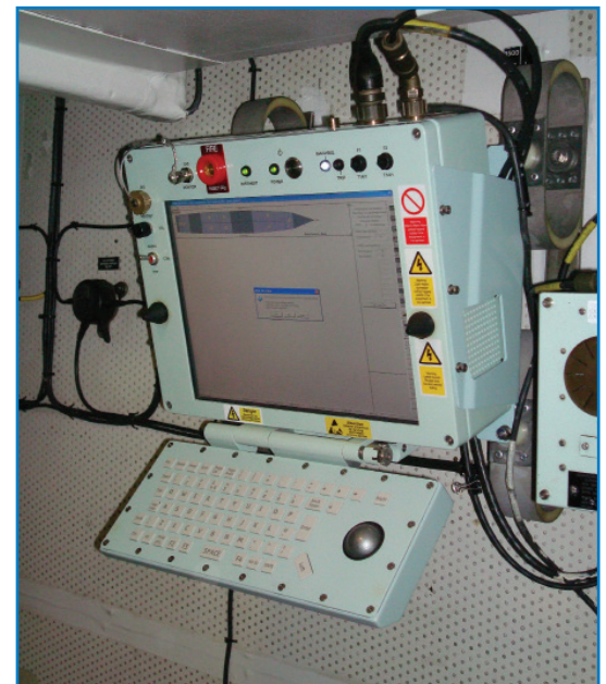
Bulkhead Mountable Control Panel