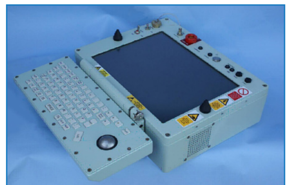
Drumgrange's HVME(TR) provides a comprehensive vibration investigation and monitoring capability